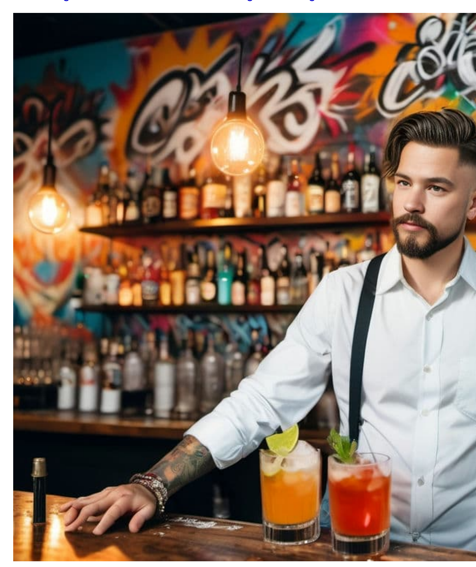
Enhancing Professional Skills for a Flourishing Bartending Career in Houston