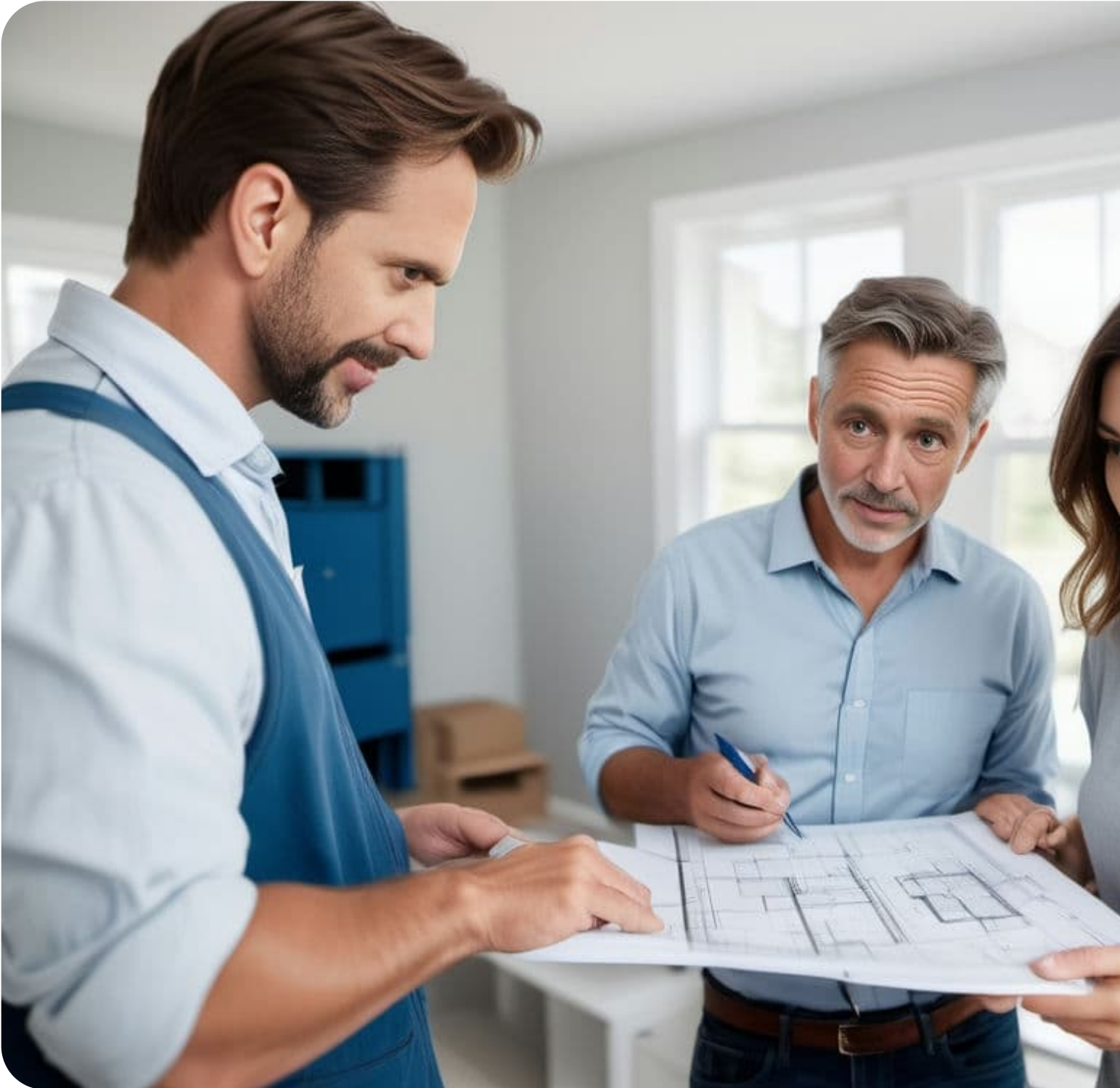
Helical Piles Explained: Revolutionizing Foundation Solutions

These factors highlight the many advantages of making use of Helical piles , emphasizing their role in improving sustainability, efficiency and efficiency in construction.