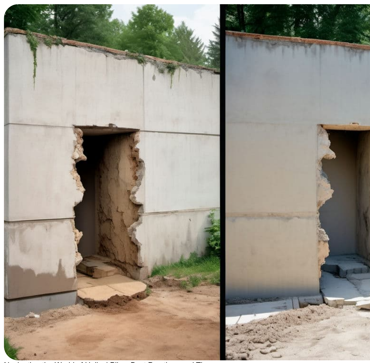
Navigating the World of Helical Piles: Best Practices and Tips

United Structural Systems of Illinois, Inc